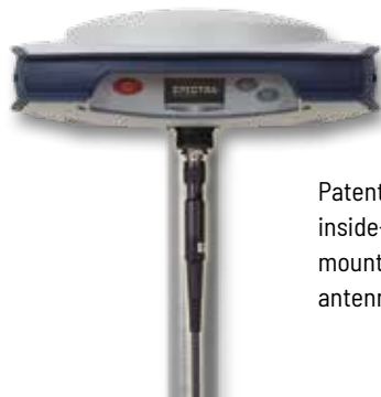
Patented inside-the-rod mounted UHF antenna design